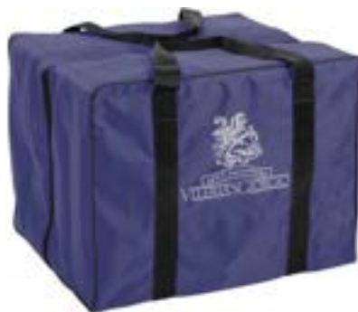
Article 11113 BAG FOR 4 SAMOAs 150 N